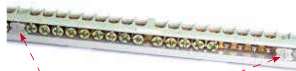
Plastic holder keeps the terminals on the position

Enclosures are completely assembled whit all necessary part, such as: